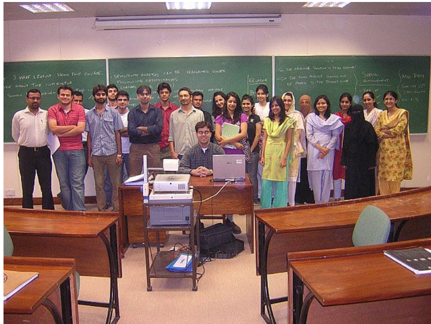
Figure 2: Snapshot of the on-campus class at LUMS

While at LUMS, the author also taught an on-campus ‘Operations Optimization’ course to the local students. Figure 2 shows a snapshot of the on-campus class at LUMS. In author’s experience, one of the best ways to learn is by experiencing or doing it. The author encourages students to actively participate and present material in class. The student learning increases significantly if they have to research material and present it in class in front of their peers.