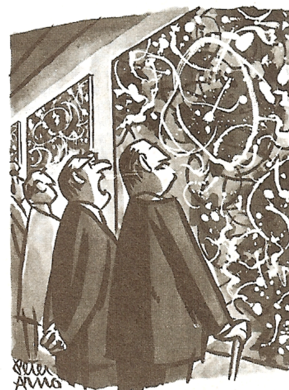
His spatter is masterful, but his dribbles lack conviction.

New Yorker, 26 Dec. 1953 (Peter Arno c1953).