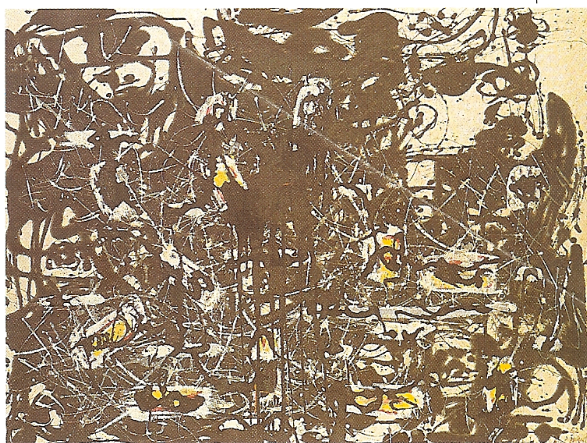
Jackson Pollock: Yellow Islands. 1952. 143.5 x 185.4cm (56in x 6ft 1in). Tate Gallery, London, England