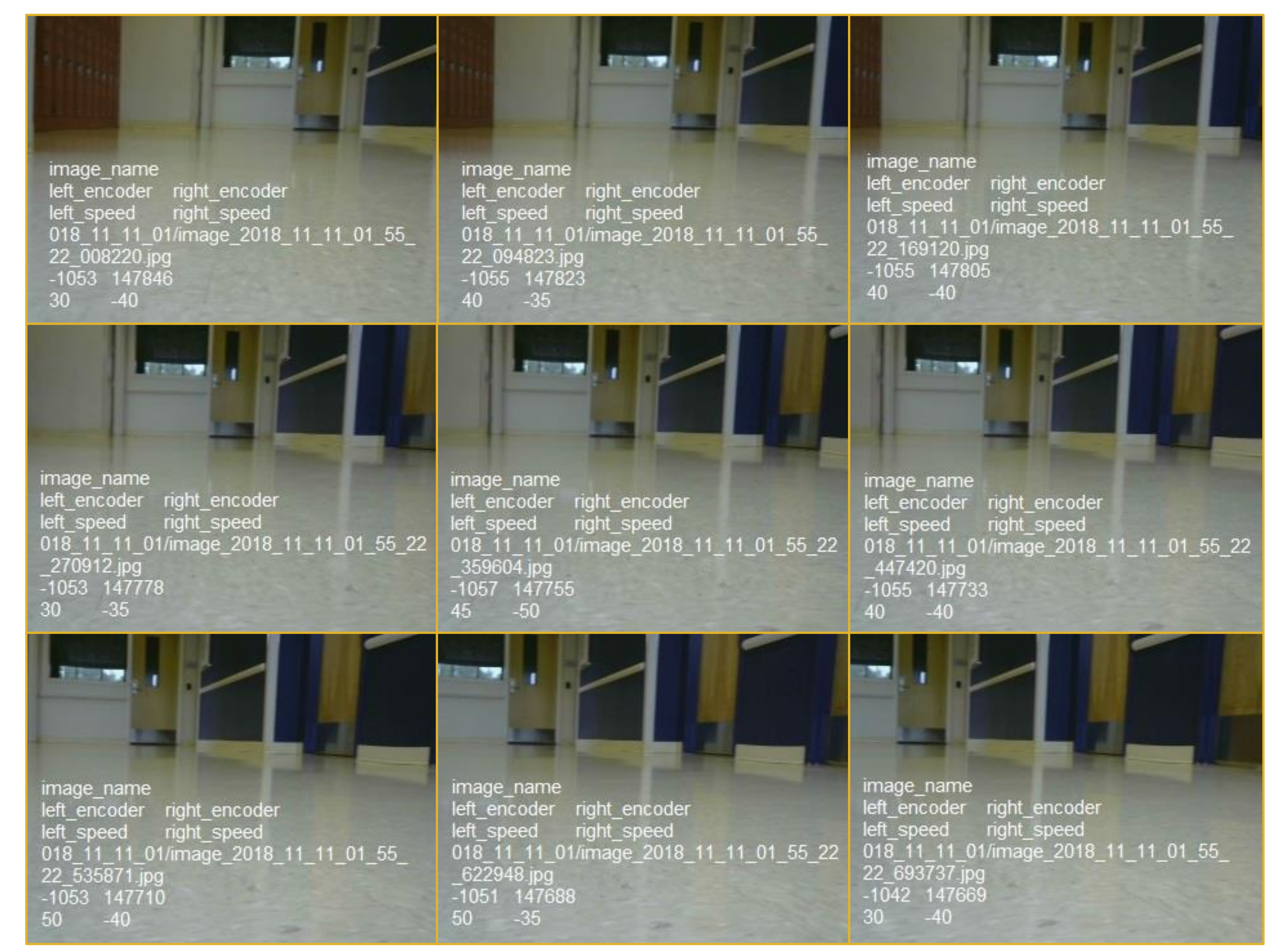
9 Datapoints with Associated Labeled Values